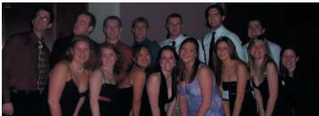
The Panhellenic Association and Interfraternity Council executive boards at MGCA.

Overall, the Panhellenic Association is extremely excited about our new programs and feel that we have gotten this semester off to a great start. We really value the opinions of our members and much of our programming is a response to their requests. The PHA is well on its way to achieving our major goals, and will continue to strive for this in the coming semester.