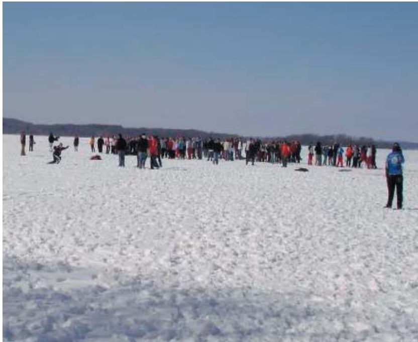
Pictured above: Alpha Delta Phi's philanthropy, Softball On Ice, took place on February 26 on Lake Mendota.

The Official Newsletter of the University of Wisconsin's Greek System